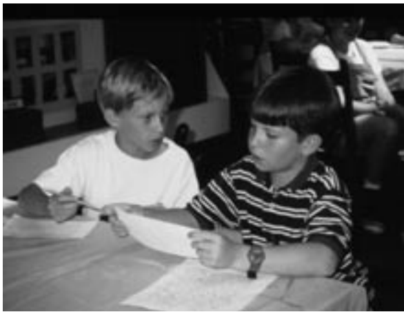
TJF Education Department

The largest part of the gift, $3 million, is for design and construction of a new education facility at Monticello, to be named the Carl and Hunter Smith History Center. Preliminary plans call for the center to be built near the existing Ticket Office and Shuttle