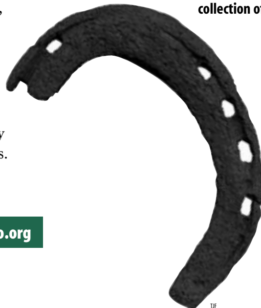
A horseshoe fragment from Monticello's collection of artifacts.

The Andrew W. Mellon Foundation, based in New York, makes grants in higher education, museums and art conservation, performing arts, conservation and the environment, and public affairs. A $600,000 grant from the Mellon Foundation in January 2000 provided initial funding for DAACS.