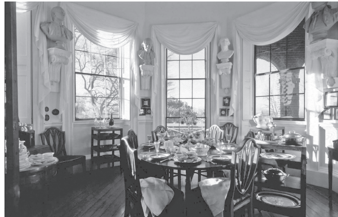
114 / Roger Stenai III