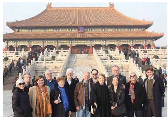
Scholars from the Robert H. Smith International Center for Jefferson Studies in China

In 2015, the ICJS will participate in the Nordic Association for American Studies Conference in Finland and in the Thomas Jefferson: Local and Global conference in Florence, Italy.